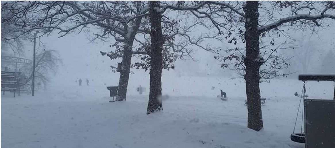
Hickory Falls Beach, north end of the lake. Winter 2018