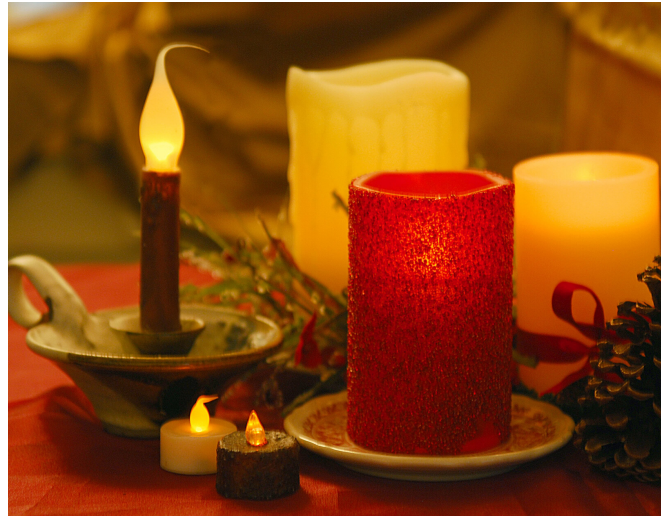
Christmas tree and candle safety is important!